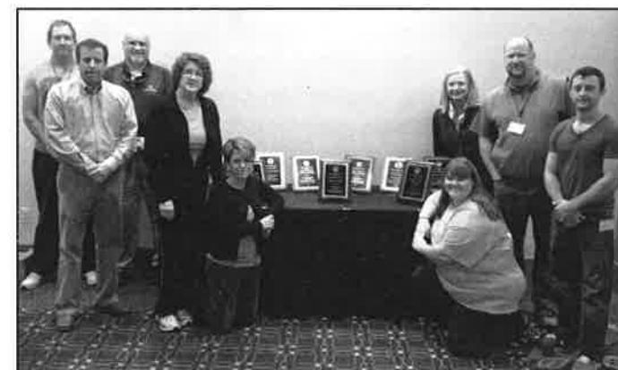
TBPA Board Members

New TBPA Members Welcome to our newest TBPA Members! We look forward to working with you. Please remember, if you would like to serve on the TBPA Board or a Committee, contact your Section Director or any Board member.