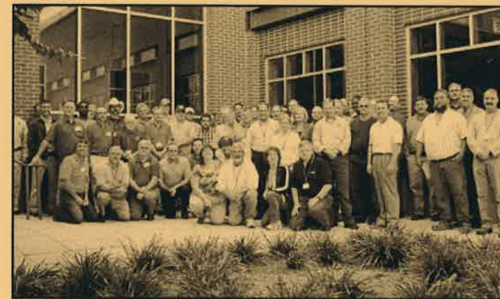
Attendees from a past TBPA Conference ... Come join the group!